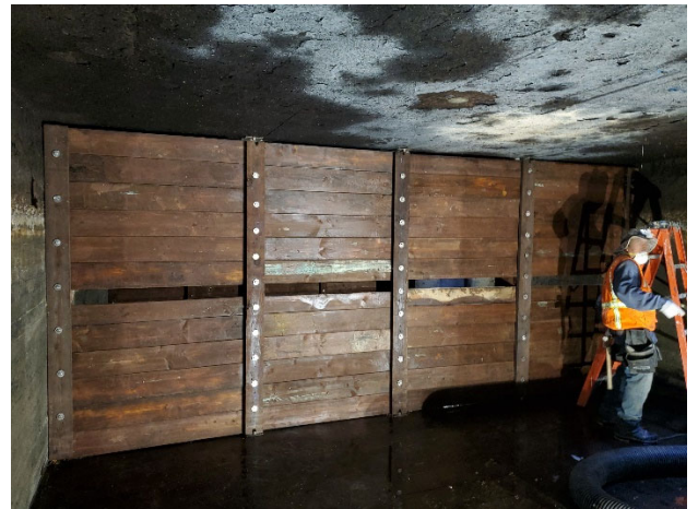
Port Costa's New Baffle Wall in Settling Tank

Port Costa has also addressed its aging infrastructure this year by rebuilding three baffles inside its settling tank at the end of Canyon Lake Drive. The tank was emptied and thoroughly cleaned while by-passing wastewater flow during the construction of the new baffle walls.